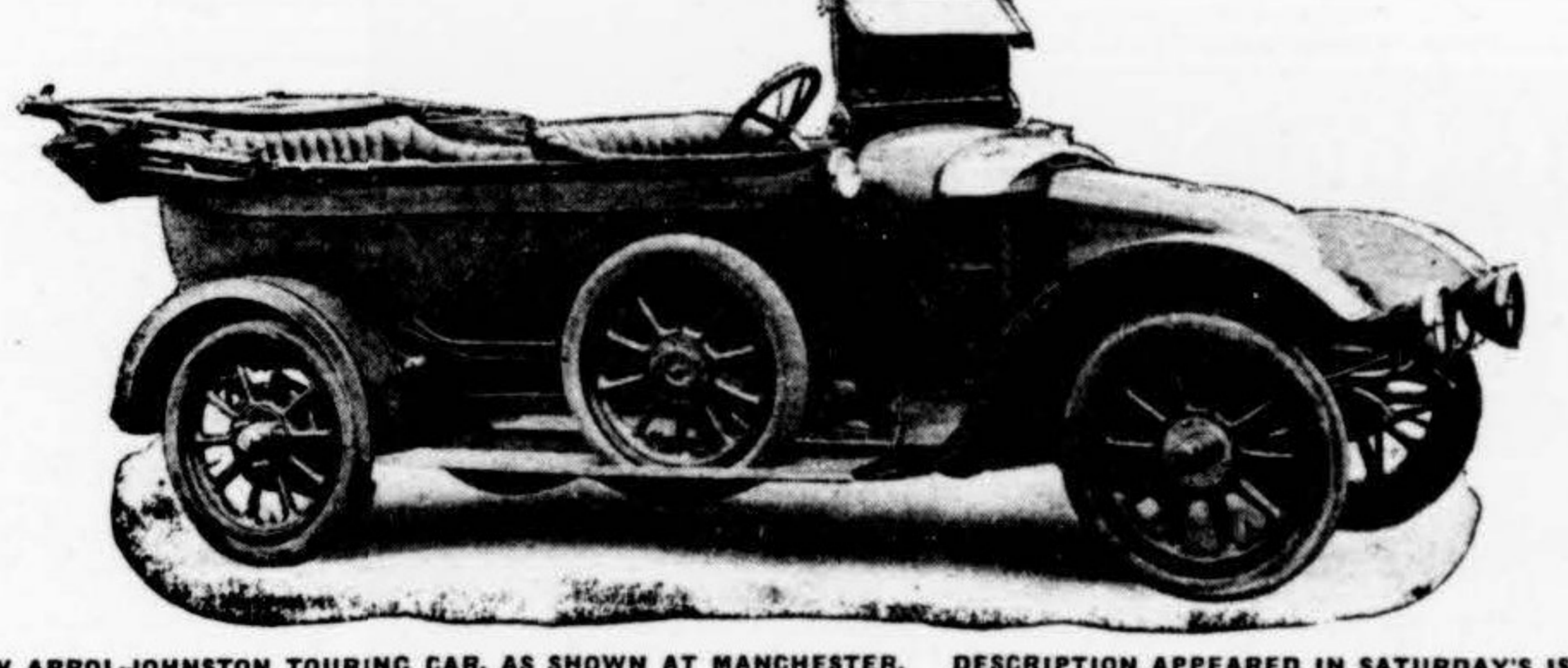
THE NEW ARROL-JOHNSTON TOURING CAR, AS SHOWN AT MANCHESTER. DESCRIPTION APPEARED IN SATURDAY'S ISSUE.

LANCASHIRE MOTOR AND ENGINEERING CO. Stand 29. Three models of the famous Stoewer car are exhibited on Stand 29 by the Lancashire Motor and Engineering Co., Preston. They are all of the same horse-power—10-16—but different in equipment. A fine example of the two-seater with which Mr. Gilchrist car- Messrs. Beattie, Jack and Co., of Deansgate, Manchester, the sole agents, are showing Peugeot models on Stand 63. The success of the Peugeot is familiar to every motorist. During the past three or four years the Peugeot car has been awarded prizes in 42 out of 48 contests including the Great races in France. The Peugeot had a wide reputation before many of the motor industry firms were heard of, and has succeeded in retaining its good name. Messrs. Beattie, Jack and Co. are also agents for the Brenna and the Cumnikar cars.