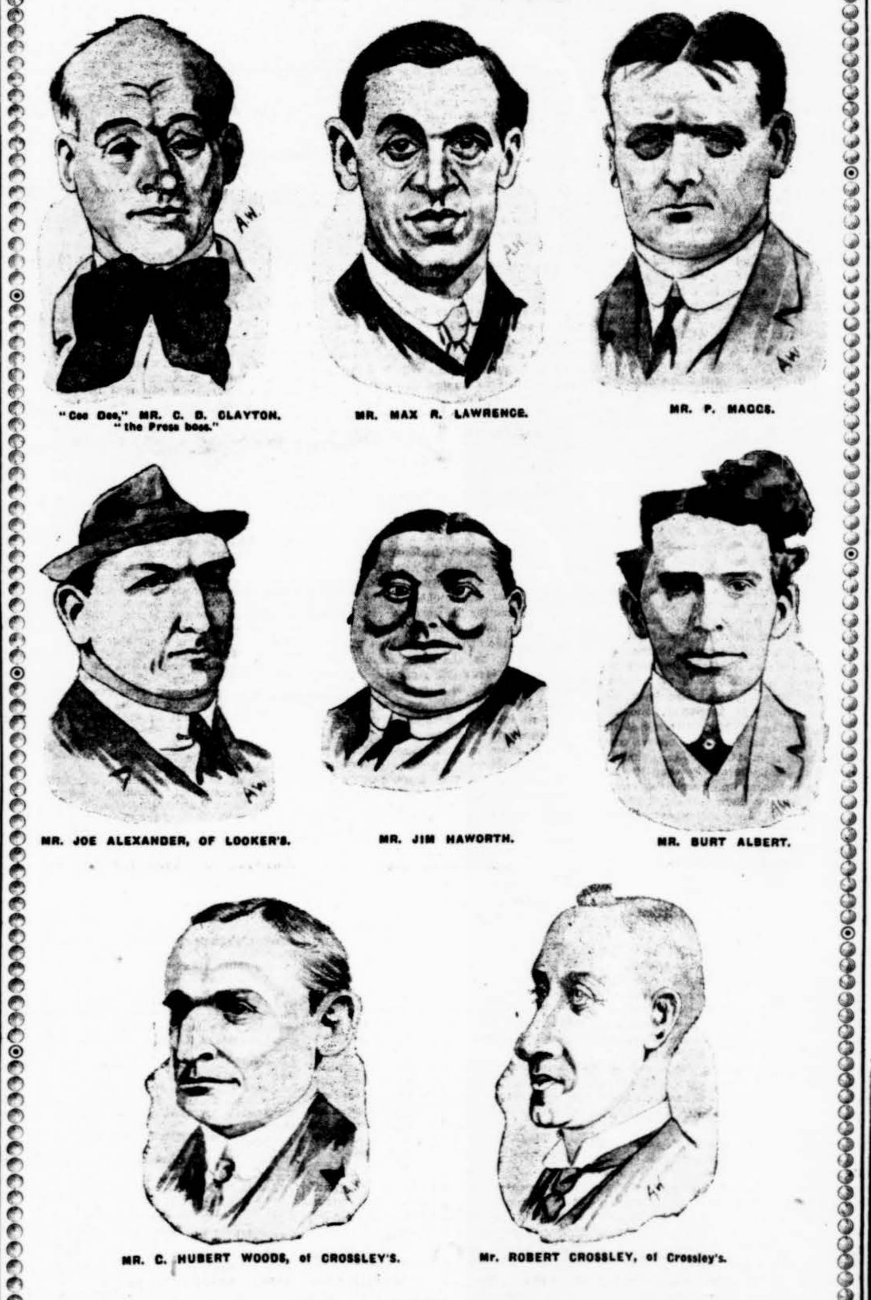
CARICATURED BY THE "OBSERVER" ARTIST.